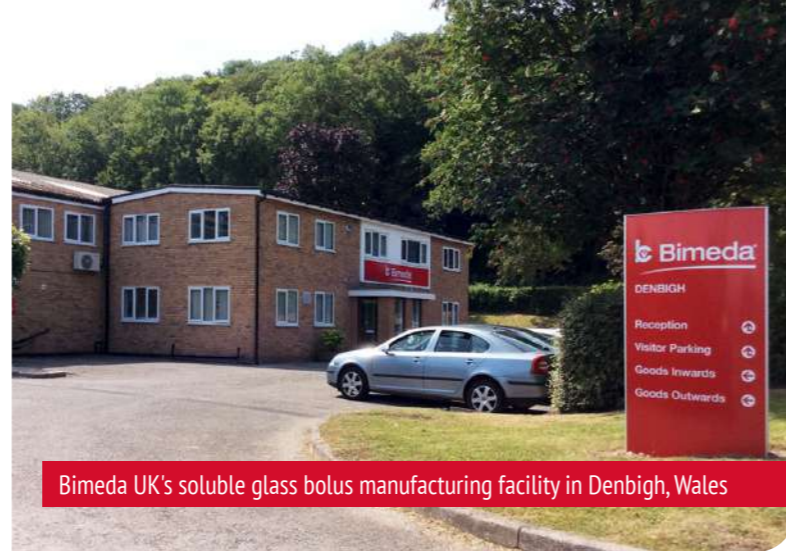
Bimeda UK's soluble glass bolus manufacturing facility in Denbigh, Wales