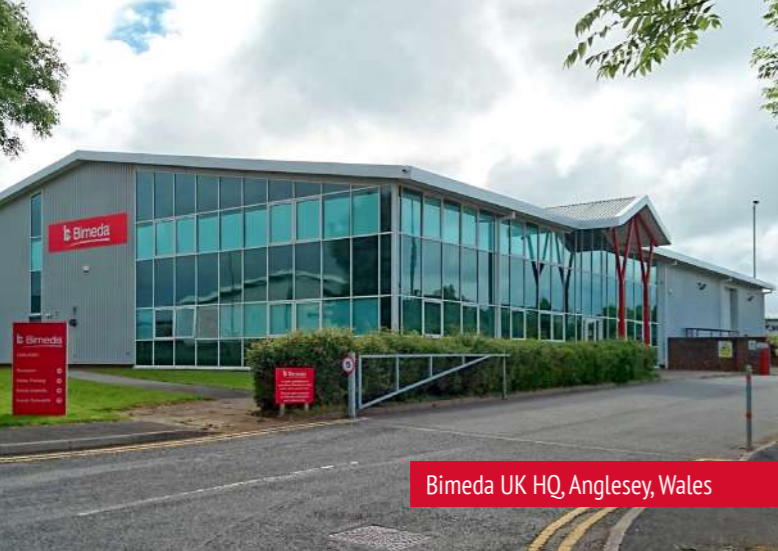
Bimeda UK HQ, Anglesey, Wales